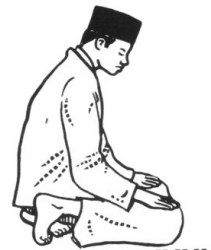
Fig.9– Tahiyât and tashahhud posture.

9- If the devotee intends to perform more than two ral'âts , he then stands up, but if he has to say prayer only for two rak'âts , he repeats also the following prayer of blessings for the Prophet:-