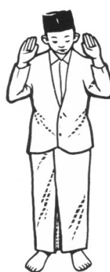
Fig. 2. – The takbirât el-ibrâm posture

Purposes to offer up to God such rak’âts (1) as the case may be, while standing up with the face qibla-wards, i.e. towards Mecca. The Arabic expression is as follows (see Fig. 1):-