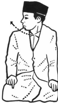
Fig. 10 – First salâm

10- This closes to two rak’âts ’ service which ends by the salâm or the greeting thus: Turning the head round to the right (see Fig. 10) the worshipper says, addressing any visible or invisible creature of God on his right:-