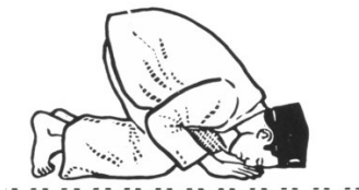
Fig. 8 – The second sajda

“All prayer and worship, rendered through words, actions, and good deeds, are due to Allah. Peace be to you, O my Prophet, and the mercy of Allah and His blessings may be showered upon you. Peace be to us and to the righteous servants of Allah. I confess that there is no deity but Allah (God) and that Muhammad is His servant and His Apostle.” (Translation)