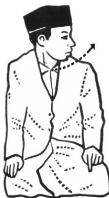
Fig. 11 – Second salâm

At the close of the whole set of the stated prayers, the worshipper raises his hands and offers up some munâjât or supplication. This usually consists of prayers selected from the Koran or traditions of the Prophet. If possible they ought to be said in Arabic; or, if not, in the vernacular (Fig. 12). (1)