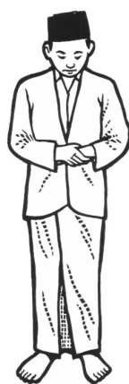
Fig. 3. – Qiyâm position

“Glory to Thee O Allah (God) and Thine is the praise, and blessed is Thy name and exalted is Thy majesty; there is no deity to be worshipped but Thee. I seek Allah’s protection against the cursed Satan” (temptation). (Translation)