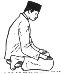
Fig. 7. – The first jalsa

“ At-tahiyâtu lillâhi, wassala-wâtu wattayibâtu, Assalâmu ‘alayka ayyuhan-nabiyu wa rahmatullâhi wa barakâtuh. Assalâmu ‘alaynâ wa ‘ald ‘ibâdillâhis-sâlihîn. Ash-hadu an-lâ Ilâha-illallâhu wa ash-hadu anna Muhammadan-‘abduhu wa Rasûluh. ” (Transliteration)