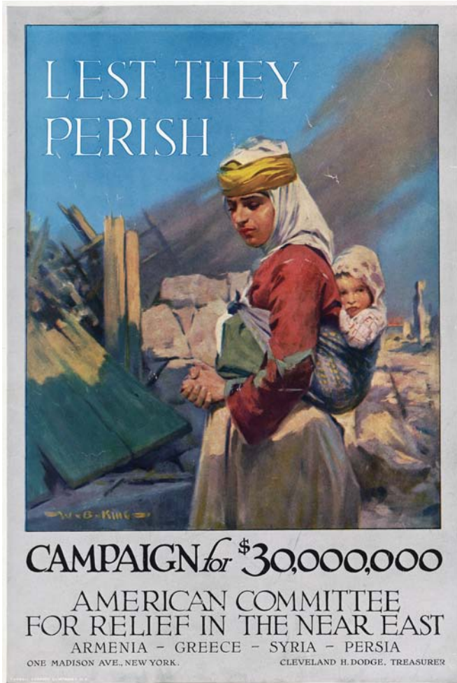
FIGURE 8.1 A 1917 ACRNE poster depicting the compassionate, if Orientalist, efforts of American humanitarianism in the Middle East.

smile ... That was in Beirut in 1916 ... [she] only lived because an American hid her and fed her at the risk of imprisonment for what the Turks called 'treason' or 'American propaganda'. 41