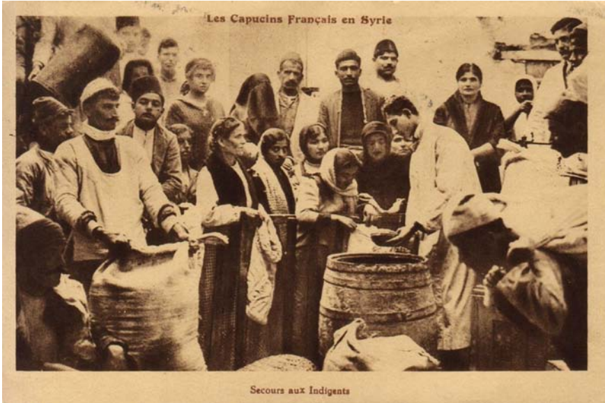
FIGURE 1.1 Postcard