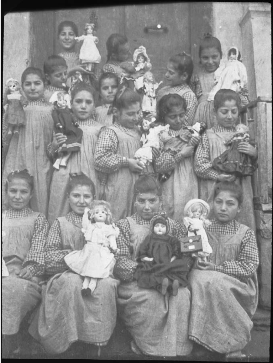
FIGURE 4.1 Girls in the orphanage in Musch with dolls from Scandinavian donors. Note: “Barn ved Musch barnehjem?”