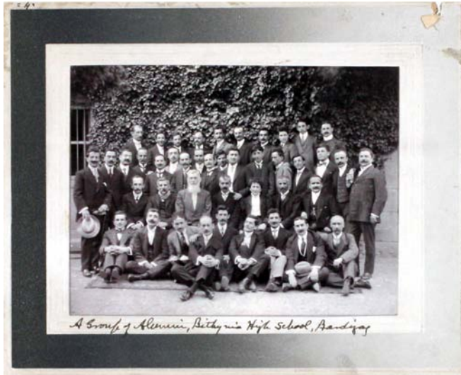
FIGURE 3.8 A group of Alumni, Bithynia High School, Bardizag

ical surroundings was absolutely dependent on the missionary influences over women—either in the form of educating, “civilizing”, or converting. 53 The redressing of women’s bodies was treated as a visible measure of progress, if not conversion. “Sleeping with day-time clothes”, “not making any toilet” in the morning or “not paying attention to their own or their children’s dressing or hair” were considered to be serious ills besetting to native women, and thus, should be cured. 54 Women’s authentic dresses and hairstyles often became topics of insult and humiliation. For instance, a certain form of headdress, common among the Greeks of the Black Sea area, was ridiculed because of its resemblance to a toothache covering.