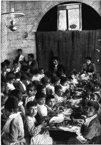
FIGURE 3.3 Orphans at Oorfa at dinner (after photograph).

the missionaries regretted the fact that the photograph could not capture the extent of misery they wanted to present to the world. Still the sense of contrast created with "after" pictures was thought to compensate for it.