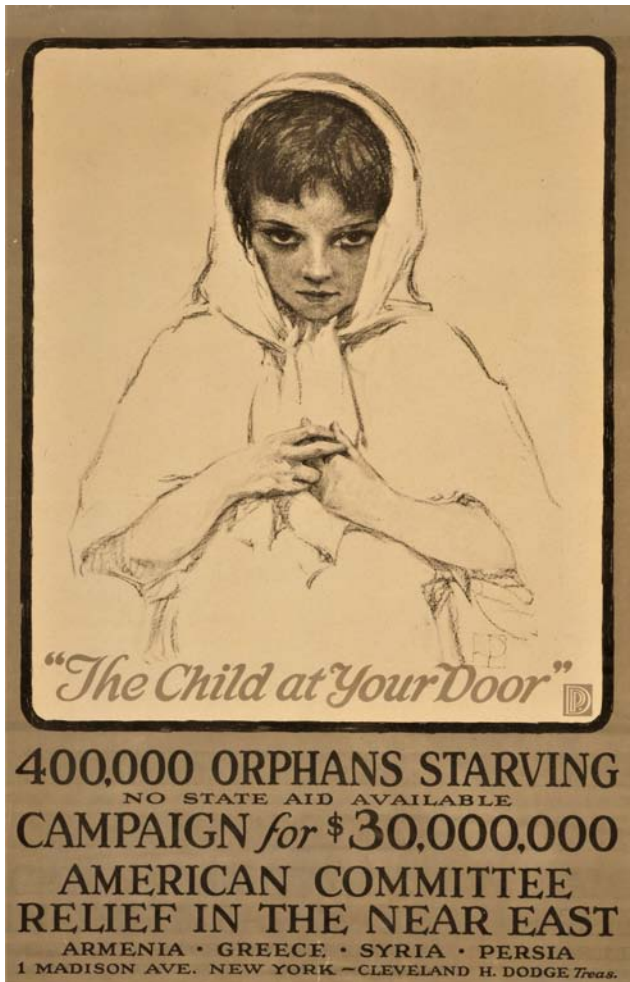
FIGURE 8.2 Another 1917 ACRNE poster asking for compassionate donations from American citizens.

Some humanitarian institutions clearly sought to convert locals as Al-Kash-kūl had warned. In northern Syria, one report from the Presbyterian Board of Missions noted the education being provided by the Syrian Protestant Institute in Homs and the Tripoli Boys School in Tripoli. The Tripoli Girls' school was highly rated by locals, according to the report, with its alumni becoming “teachers in the village schools, wives of preachers and mothers of boys who have become teachers and preachers”. 42