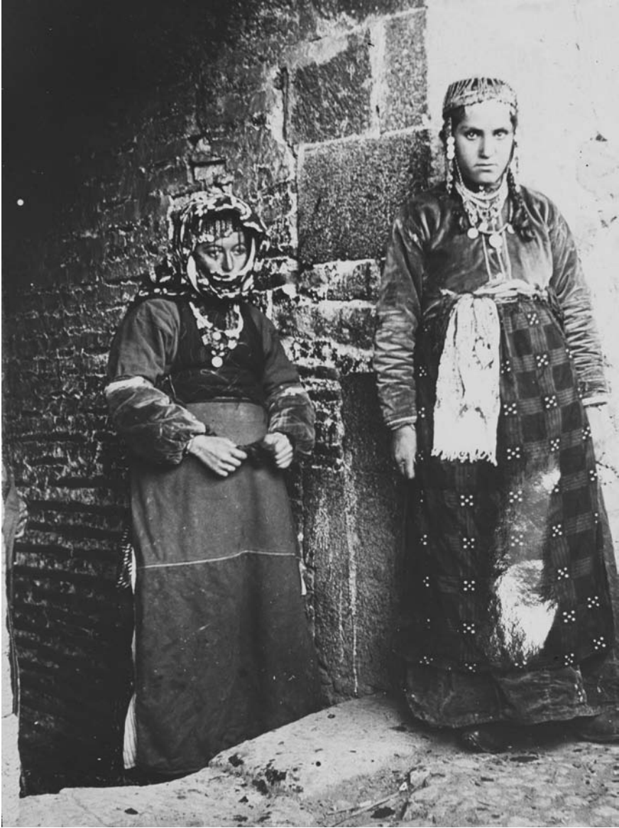
FIGURE 4.2 Armenian women.