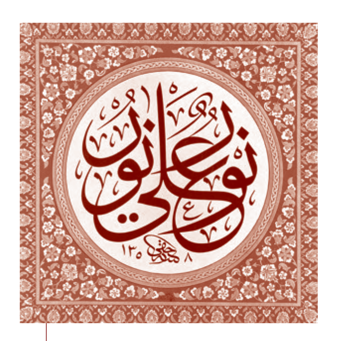
"Light upon Light." (Qur'an, al-Nur, 24/35)