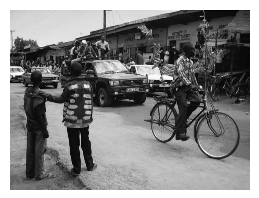
Figure 6.1 An Orange rally led by Musyoka Kalonzo, now Vice-President, at Kapenguria, Transnzoia District, on 10 October 2005

constitution and an orange to indicate rejection. The debate over whether to vote "Yes" or "No" became polarized around certain key paragraphs in the Wako Draft and politicians mobilized their people, mostly on ethnic lines, to accept or reject the proposed constitution. The Kadhi's courts' place in the constitution and the "invention" of religious courts for other faiths became an issue, among many others, that was used by opponents of the proposed constitution to urge people to reject it.